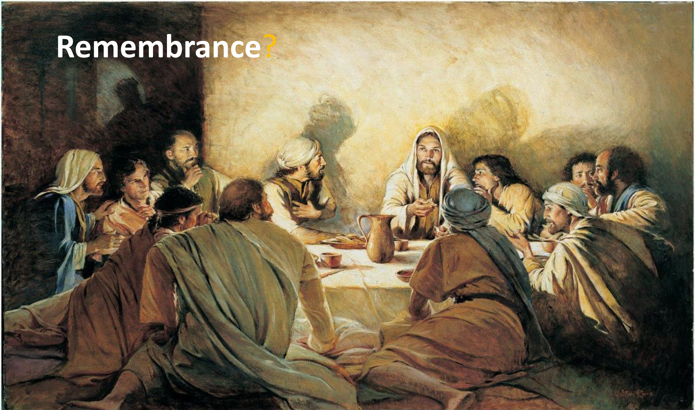
In Remembrance of Me, by Walter Rane